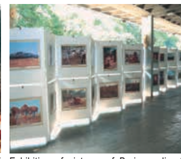
Programme Braj Darshan on the life of Budh Presenting Sammaniya Sanrakshak Braj Vikas Gosthi at Mathura 2003, LtoR Shri Exhibition of pictures of Braj mandirs &