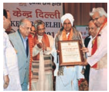
Rakshak Dal) at Holi function Delhi - 2014.