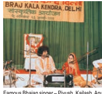
at BKK function July, 1994.